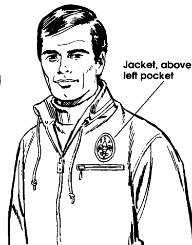
Jacket, above left pocket