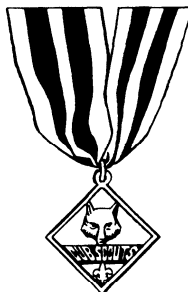
Cubmaster Award, No. 00949