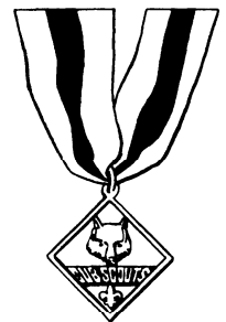
Cub Scouter Award, No. 00951