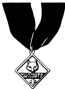
Den Leader Coach Award, No. 00953