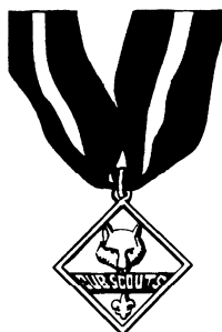
Den Leader Award, No. 00950