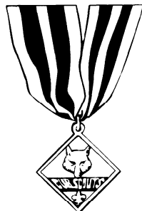
Tiger Cub Coach Award, No. 17687